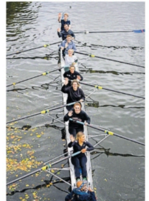
Don't rock the boat: Join the crew with Cambridge Rowing Experience

The team spirit continues with the post-row ritual of washing down the