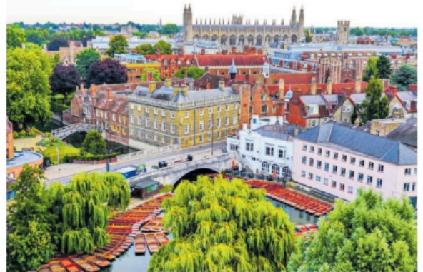
Historic: Cambridge's handsome university colleges are at the city's heart

Since he set up the Cambridge Rowing Experience in 2021, he's found the easiest way to get people rowing is