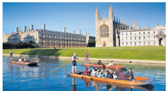
Slow boat: Tourists and students can also enjoy traditional punting on the Cam

Individual weekend rowing with Cambridge Rowing Experience, £65pp; £175 for a two-person boat, £350 for four and £595 for eight. See cambridgerowing.com